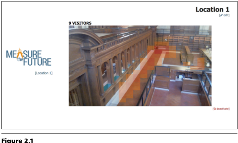
Early Measure the Future Interface

prevents precise identification of individual patrons.