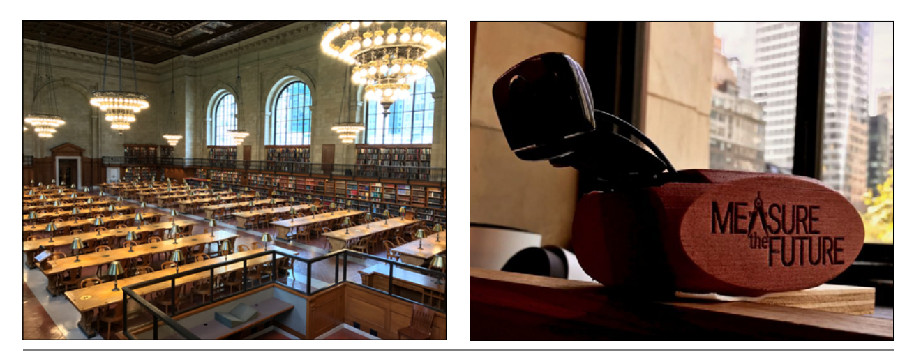
Figure 2.3 Measure the Future sensors at NYPL

After evaluating options, it became obvious that moving to the Raspberry Pi–based hardware configuration was indeed the best option, and so began the development of the Measure the Future Beta program.